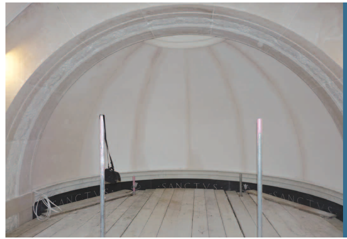
The bespoke Grecian-style frieze and a swimming Dolphin frieze were designed by Craig Hamilton and manufactured in our workshop.