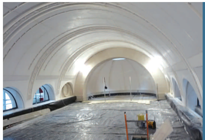
Barrel-vaulted fibrous plaster ceiling in the Chapel with elaborate ornamentation

Commenting on the contribution made by Ornate Interiors, Craig Hamilton wrote: