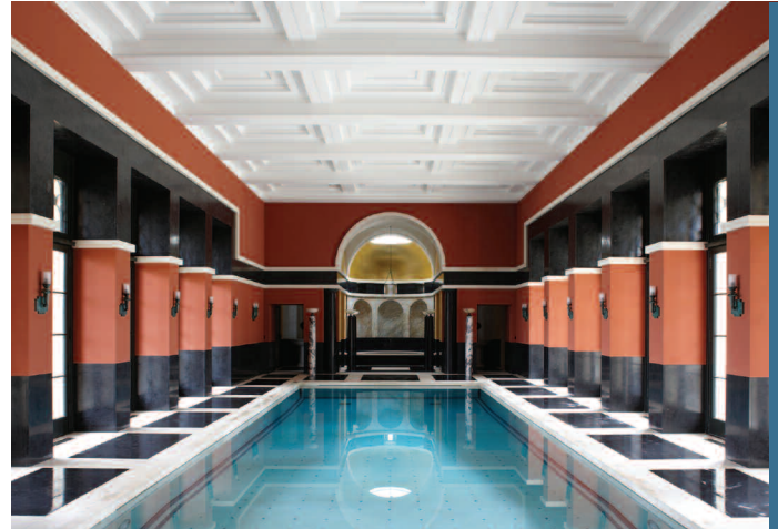
The completed Bath House

Ornate Interiors were asked to provide the traditional plastering craftsmanship necessary to realise a unique vision: buildings that incorporate the imposing structural elements of classical temples with many embellishments alluding mainly to the temple of Aphrodite, the goddess of beauty who arose from the sea, but also, more discreetly, to Angus Og, the Celtic God of Love.